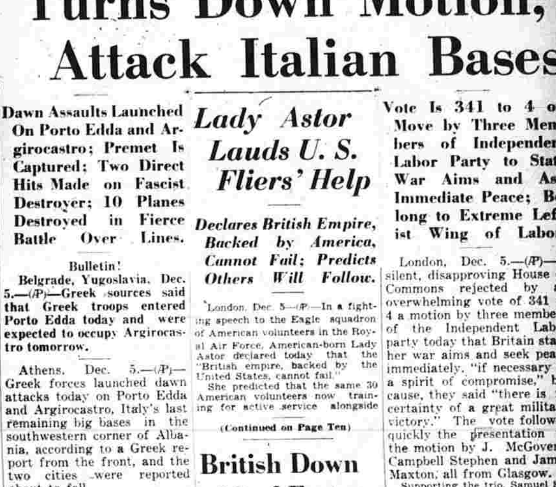
Lady Astor Lauds U. S. Fliers' Help

London, Dec. 5.-(AP)-In a fighting speech to the Eagle squadron of American volunteers in the Royal Air Force, American-born Lady Astor declared today that the "British aviators, backed by the United States, cannot fail."